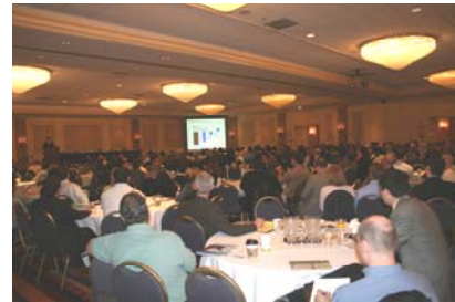
About 500 real estate professionals attended the 2009 Building Green Chicago Conference on April 7th.

See the growing list of exhibitors below. We encourage you to get your application in now to reserve your space for the April 2010 conference. Past sponsors: